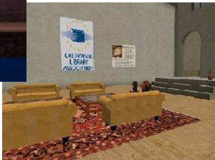
CLA Lounge in Second Life