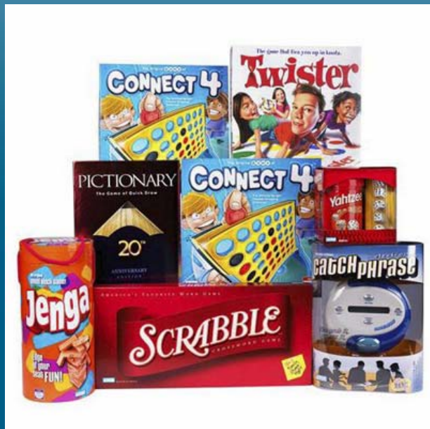
Kit for ages 13+